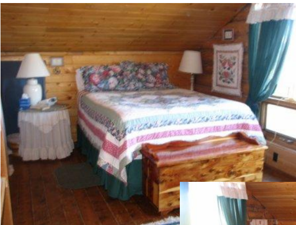
Mt Princeton Suite w/private bath