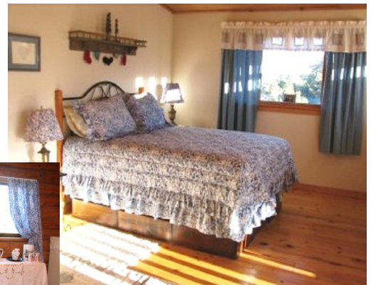
Buffalo Peaks Room